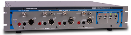
APx516B with HDMI2+eARC digital audio module

The APx516B uses the same APx500 measurement software that is used on all other APx series analyzers and includes features like input signal monitors and file analysis. While the APx516B comes with a set of out-of-the-box measurements, you can maximize the value and functionality of the measurement software with subscription licenses.