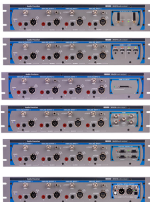
APx516B Digital Module Options